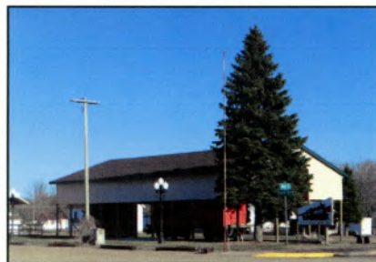
Caboose building and restrooms