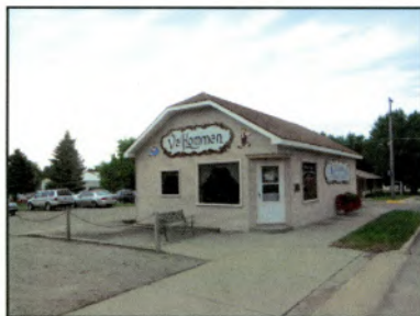
Skoglund / Ness museum