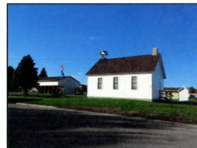
Starbuck School Museum

Thank you to all that have responded to the membership drive!